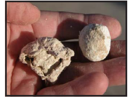
Golf ball sized sulfur pellets can still be found at the ruins of Sodom and Gomorrah!

burned extremely hot. The samples I collected would burst into an immediate toxic flame when touched with a match. If you visit the site just after a rain storm you will find the brimstone pellets on the flat tops of the ruins. It would appear that a torrential rainstorm of burning sulfur fell upon these ancient cities.