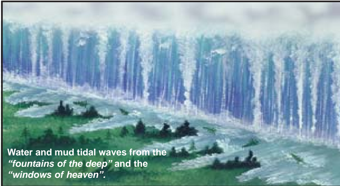
Water and mud tidal waves from the “fountains of the deep” and the “windows of heaven”.

The Bible tells us that in the days of Noah, approximately 4,500 years ago, the “fountains of the great deep were broken up and the windows of heaven were opened.” Genesis 7:11