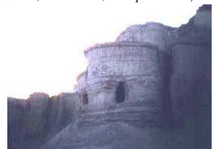
What appear to be man-made structures are still visible at the Gomorrah site at the foot of Masada.

During the first century, the Jewish historian Josephus recorded the visible existence of the ruins in his day -- “ Now this country is then so sadly burnt up, that nobody cares to come at it; . . . It was of old a most happy land, both for the fruits it bore and the riches of its cities, although it be now all burnt up. It is related how for the impiety of its inhabitants, it was burnt by lightning; in consequence of which there are still the remainders of the divine fire; and the traces of the five cities are still to be seen. ” (Josephus in his “ Wars Of The Jews, ” Book IV, Chapter VIII)